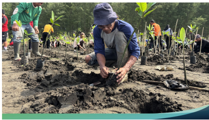
Mangrove restoration efforts in Karangbenda Village, Cilacap