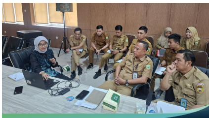
WRI led the discussion with government officials.