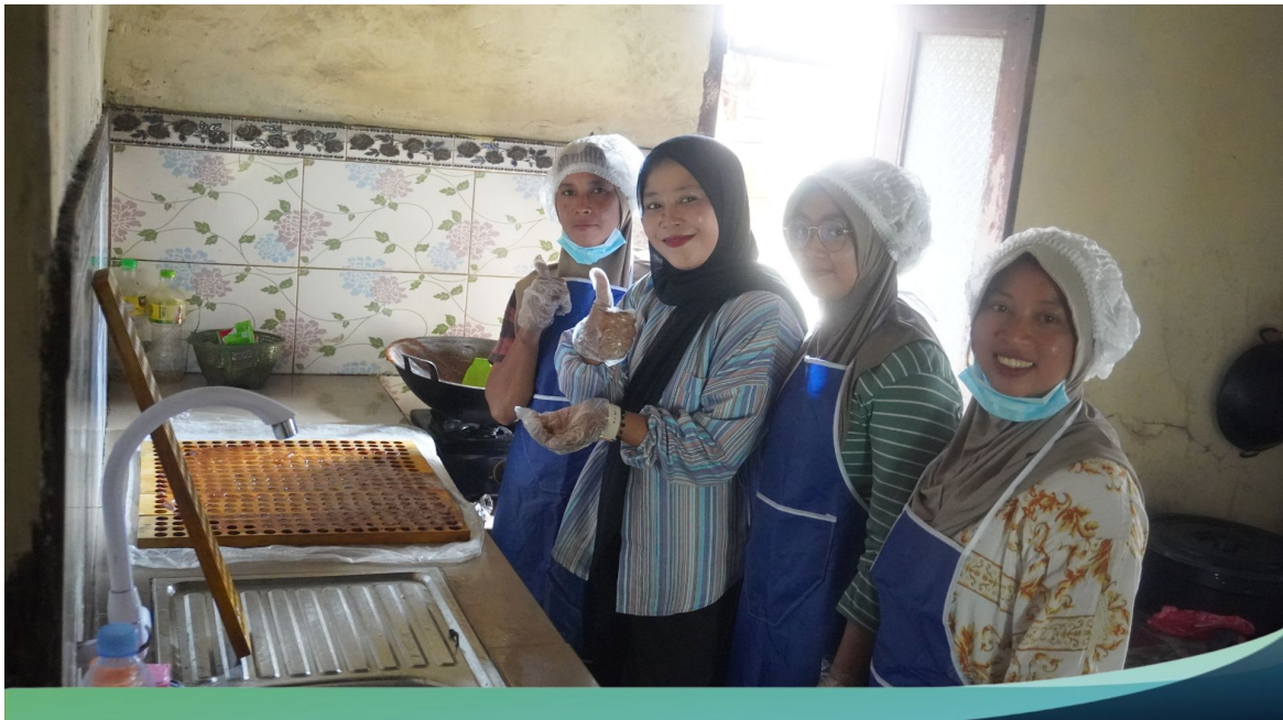
Community-based agroforestry enterprises for sustainable and collective land use project

Stories from the field about how women, men, and/or group/community implement the principle of gender transformative principles in their work.