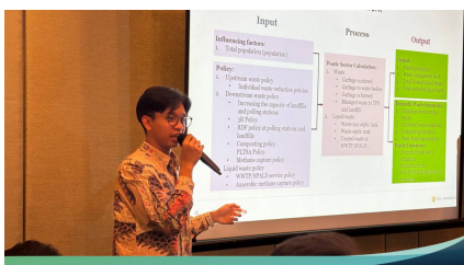
WRI Indonesia guided participants in the training session.

to validate the modeling baseline and to inventory medium- and long-term sectoral policies for creating a policy-intervention modeling scenario. Read more.