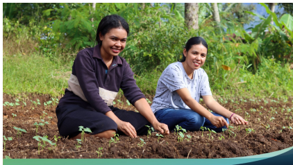
Girls in East Nusa Tenggara Are Productively Growing Green Beans to Empower Their Lives

News articles from Small and Medium Grant Projects