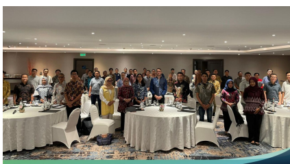
SETI's Industrial Energy Lab Batch 2 Socialization

WRI Indonesia, in collaboration with Bappenas, convened a capacity-building session for 29 government partners from across directorates within the PSDALH Deputyship at the Ministry of National Development Planning/Bappenas. Read More.